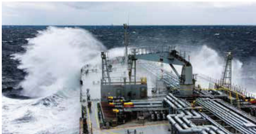
One of the TORM fleet